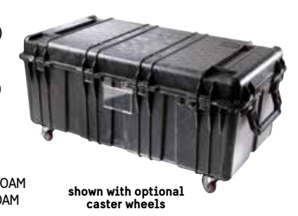
shown with optional caster wheels

WEIGHT: 43.09 kg (95 lbs.) WITH FOAM 35.92 kg (79.2 lbs.) NO FOAM